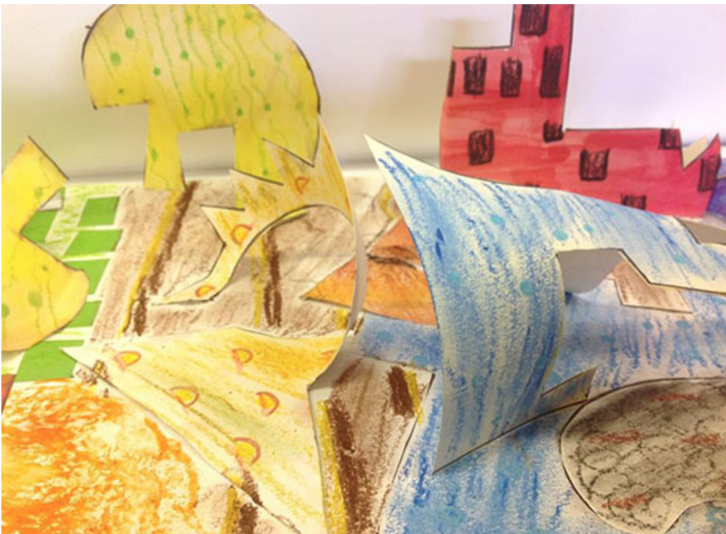
Relief Environment in Paper - This piece is currently being shown as part of the Engage