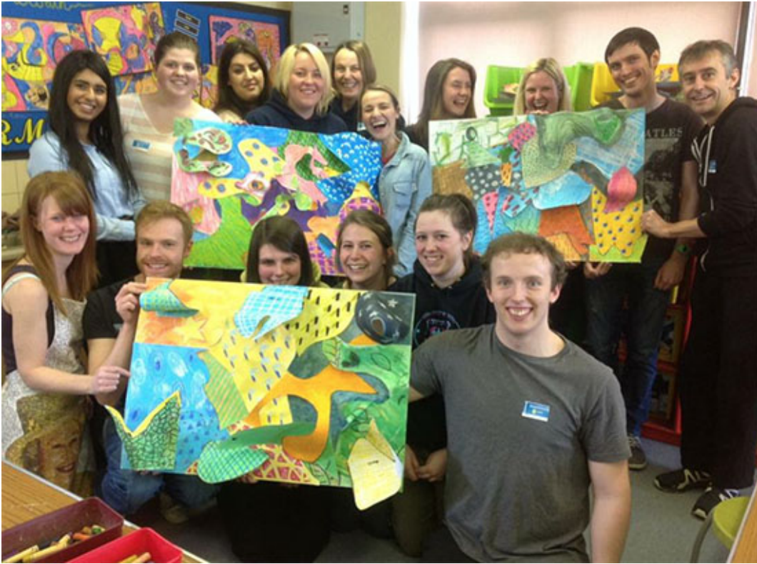
Initial Teacher Training Course for Kirklees Calderdale Primary Teachers - Art, Craft and Design