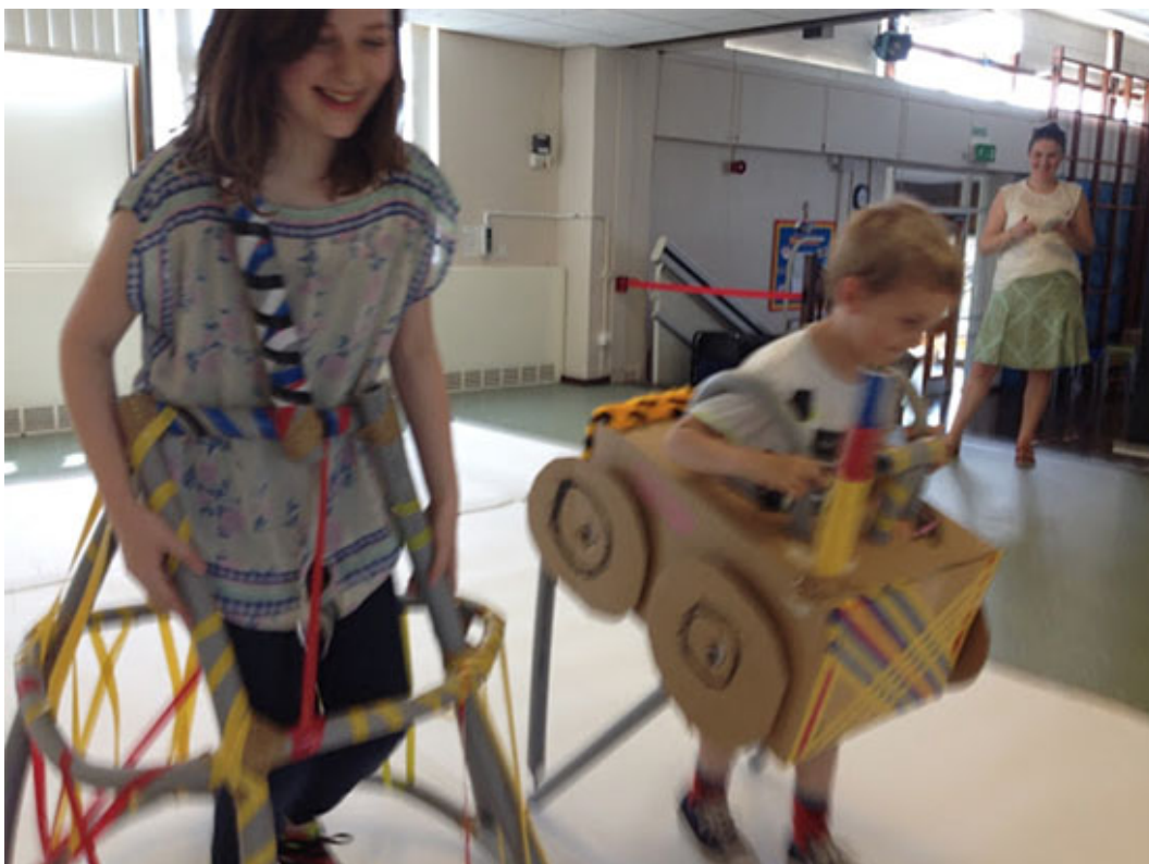
Drawing Machines at Battyeftord Primary School