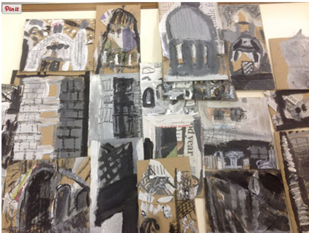
Year 4 Rome Topic