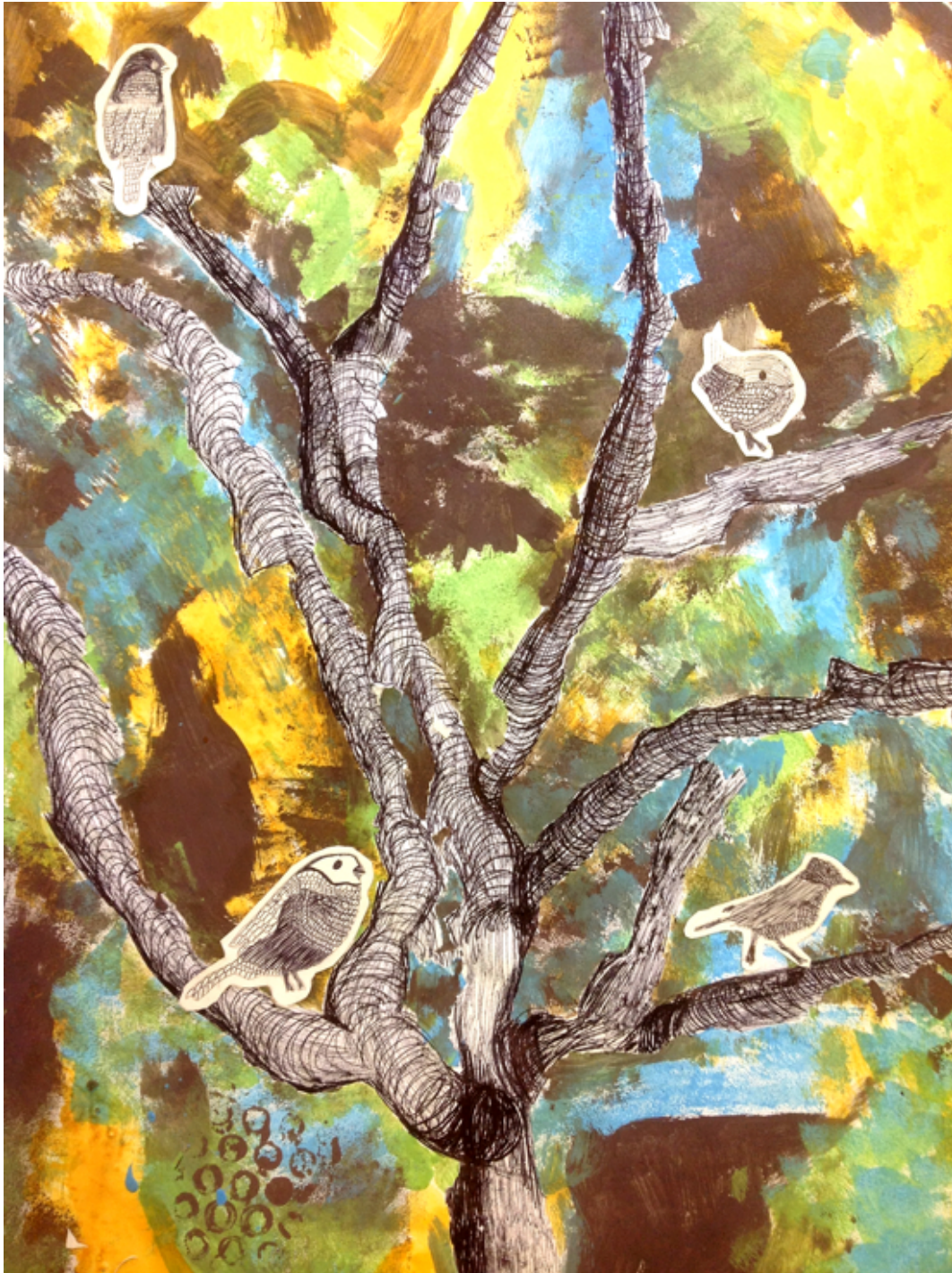
Birds in the Trees