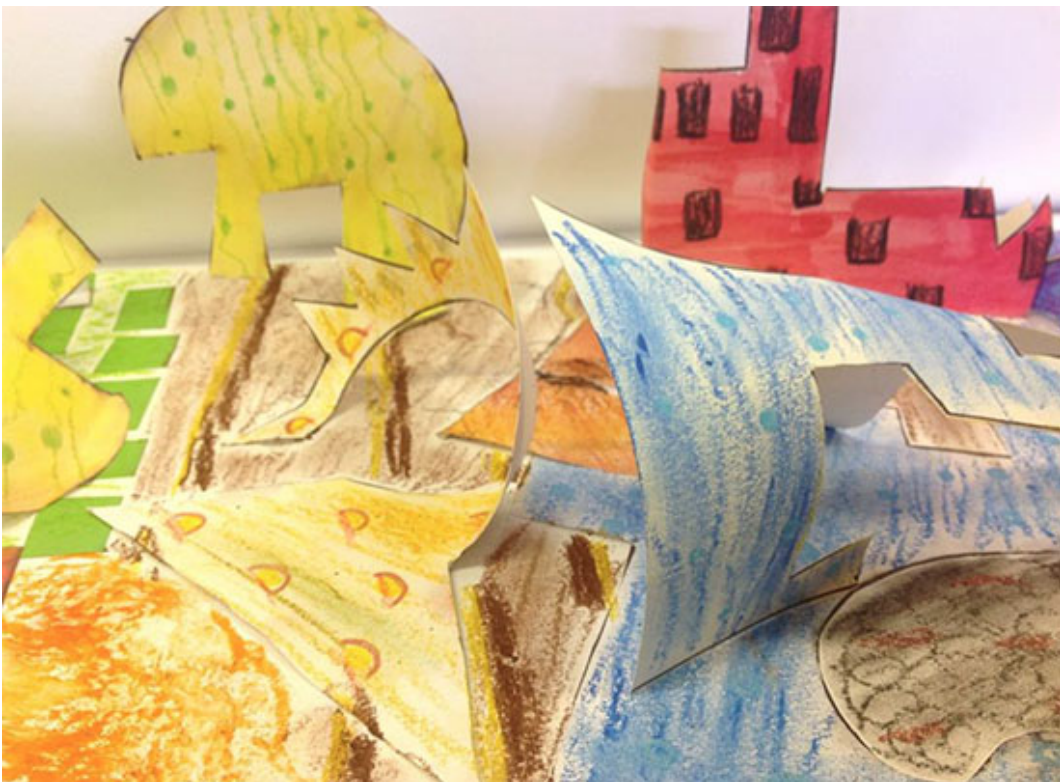
Relief Environment in Paper - This piece is currently being shown as part of the Engage