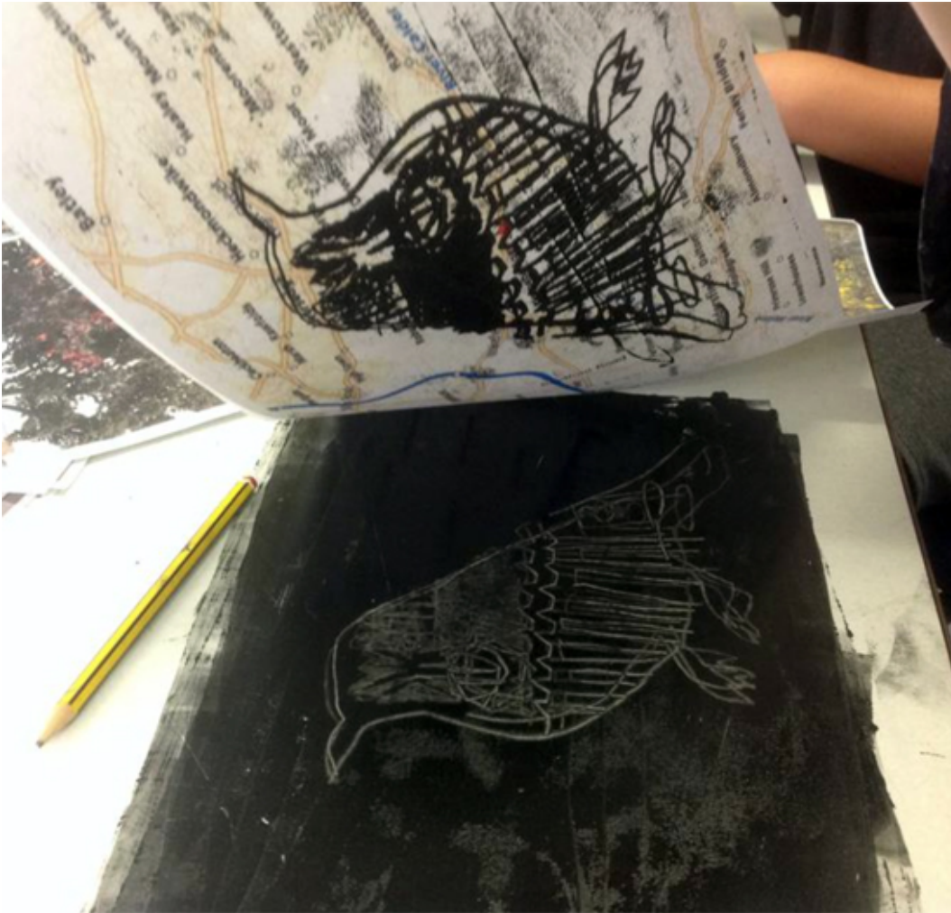
Printing inspired by Hester Cox

This is a sample of resource created by UK Charity AccessArt. We have over 1100 resources to help develop and inspire your creative thinking, practice and teaching.