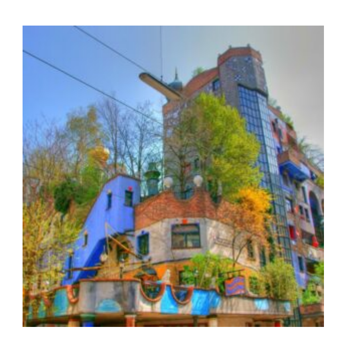
Drawing Source Material: Exploring Architecture