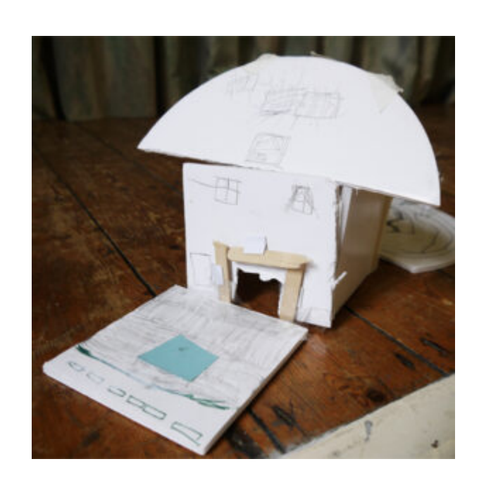
ink and foam board architecture