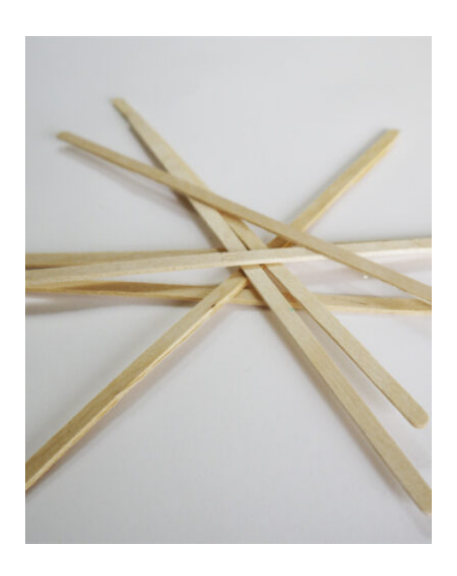
See All AccessArt Architecture Resources