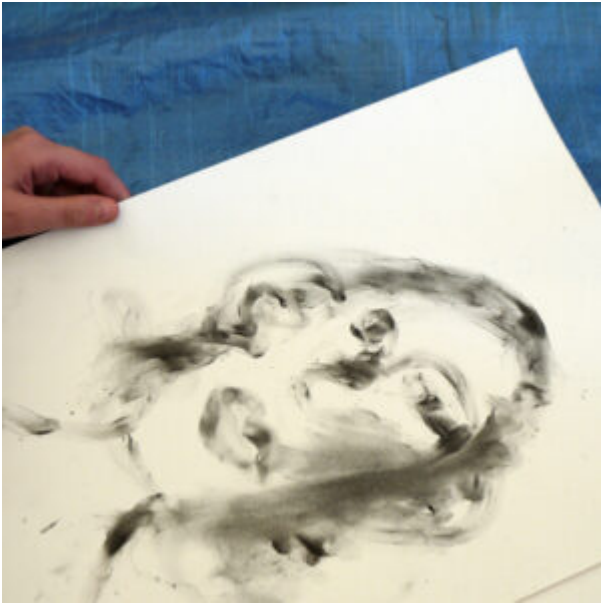
elastic band sketchbook