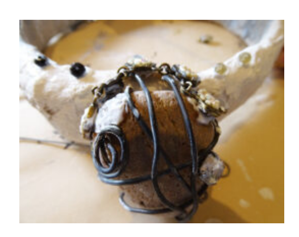
Cards to Prompt Making

Choose your favourite activity from the projects below.