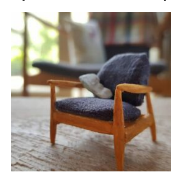
<u>The Chair and Me - Making Larger Sculptures</u>

Make small playful sculptures which relate to the ground they stand on. Perfect for a small scale exploration of sculpture! Read More