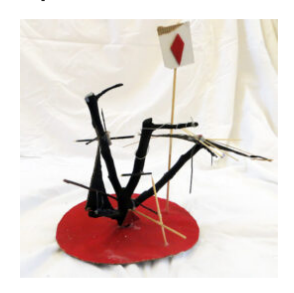
<u>Belonging to the Ground - Making Mini Sculptures</u>

Use our Making Prompt Cards to feed your exploration of making sculpture! Read More