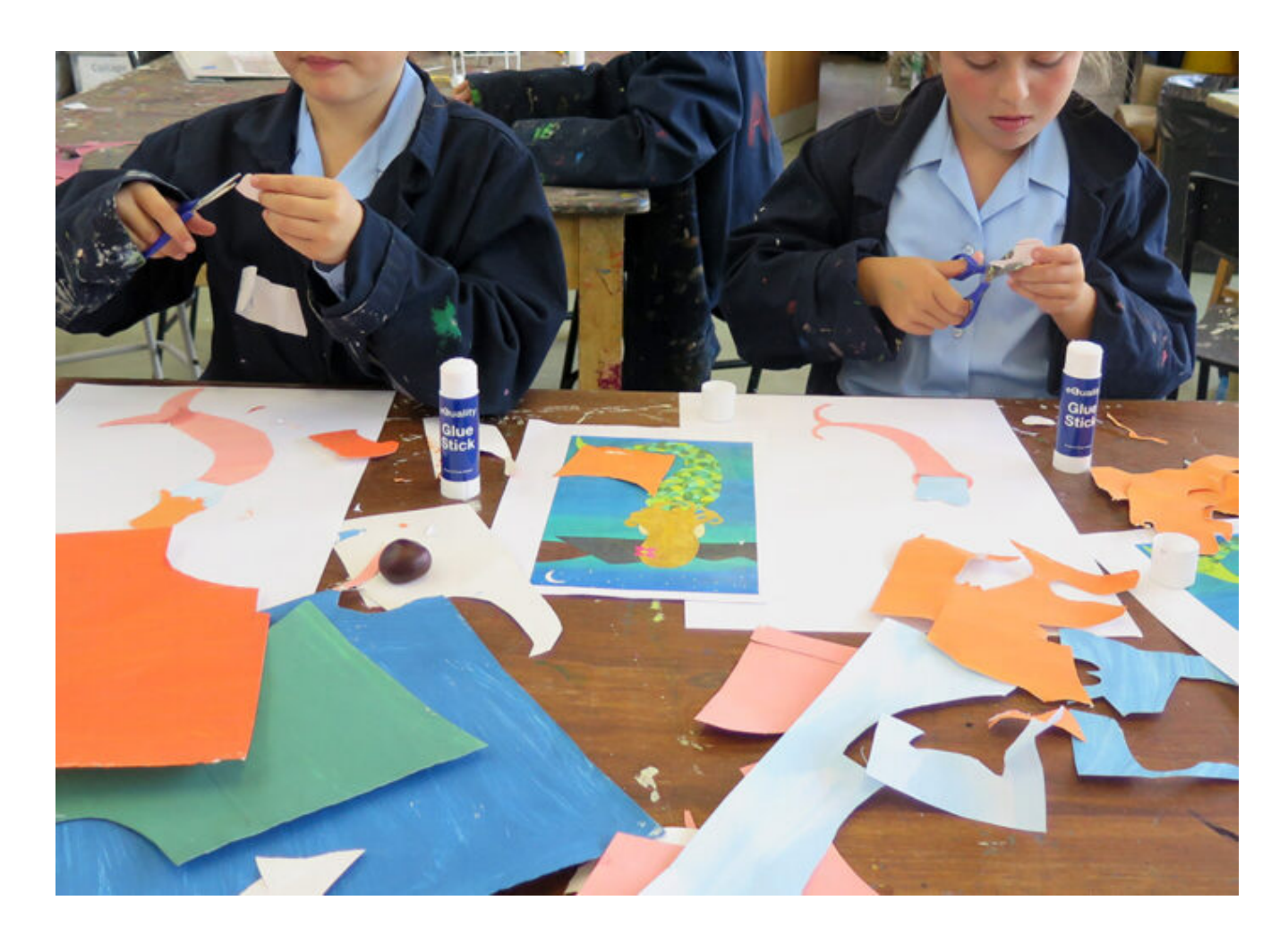
Step 4: Reflect

Use the resource here to help you run a class "crit" to finish the project.