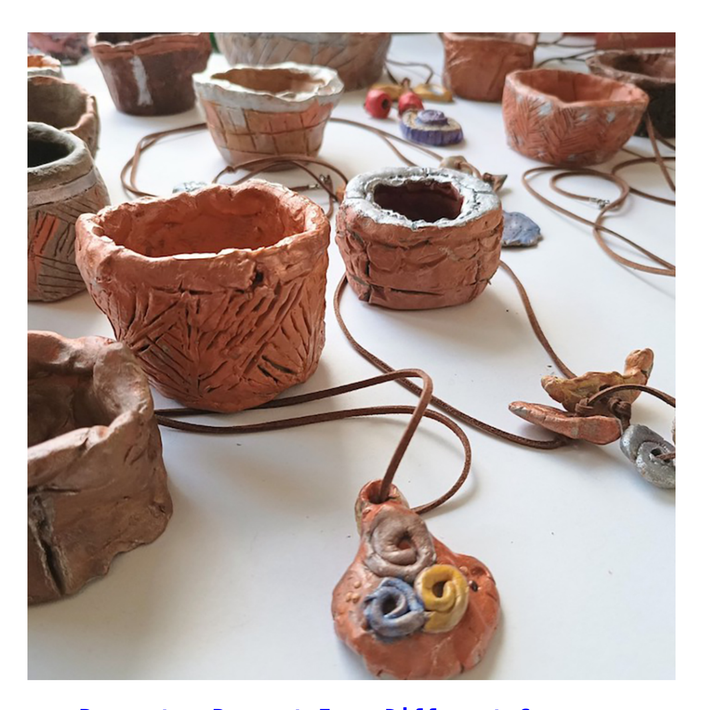
Request a Payment In a Different Currency